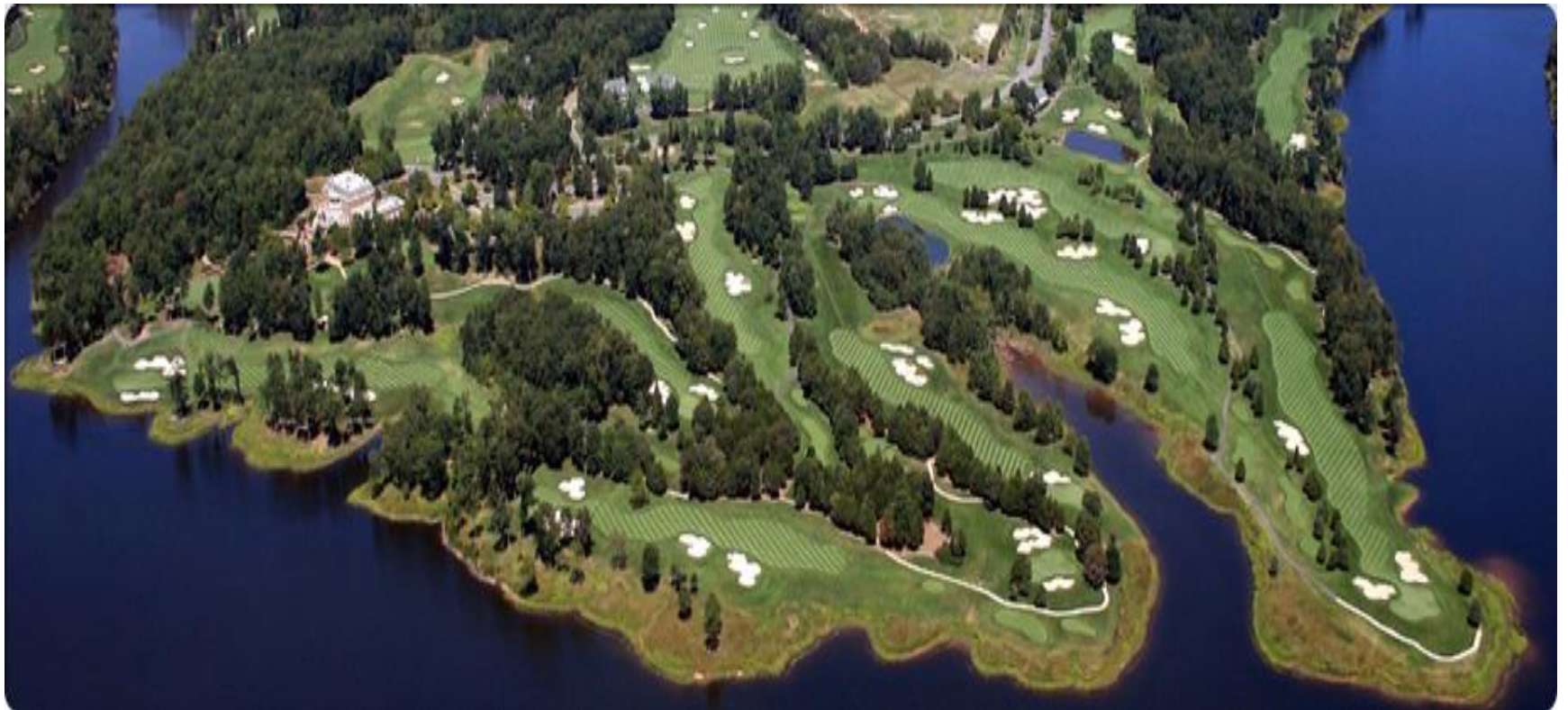
Part of the RTJ Course, almost surrounded by Lake Manassas