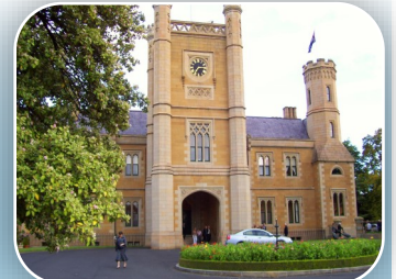
Some photos of Claremont Golf Club, situated on the banks of the Derwent River